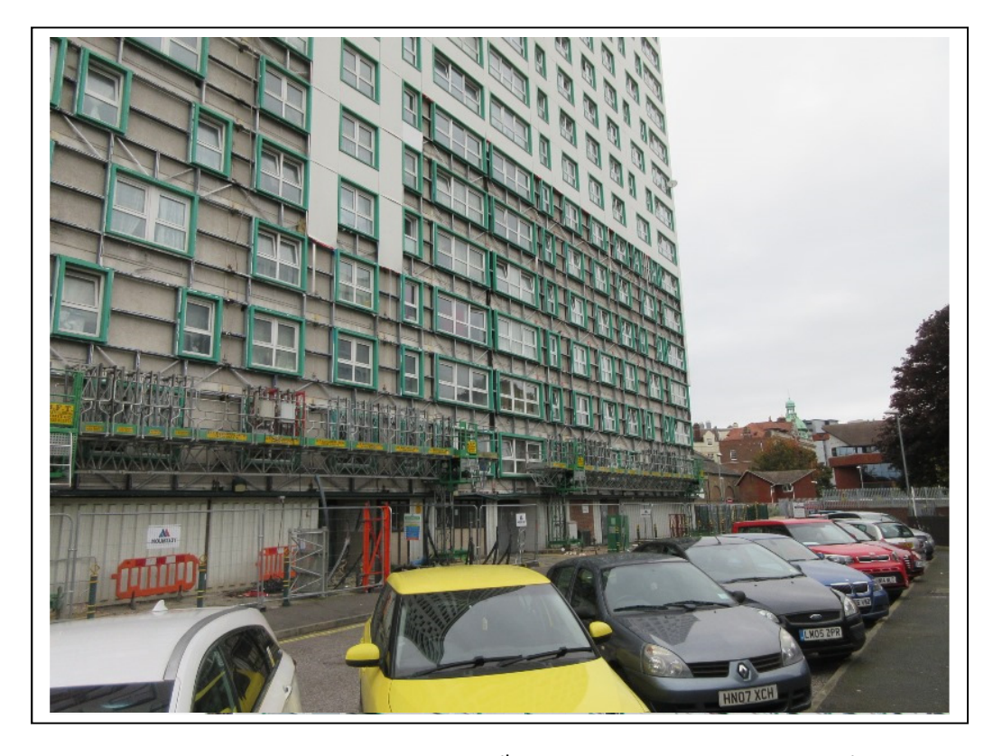
Figure 2 - East Elevation cladding removed to 6<sup>th</sup> floor, mast climber installed to 1<sup>st</sup> floor level