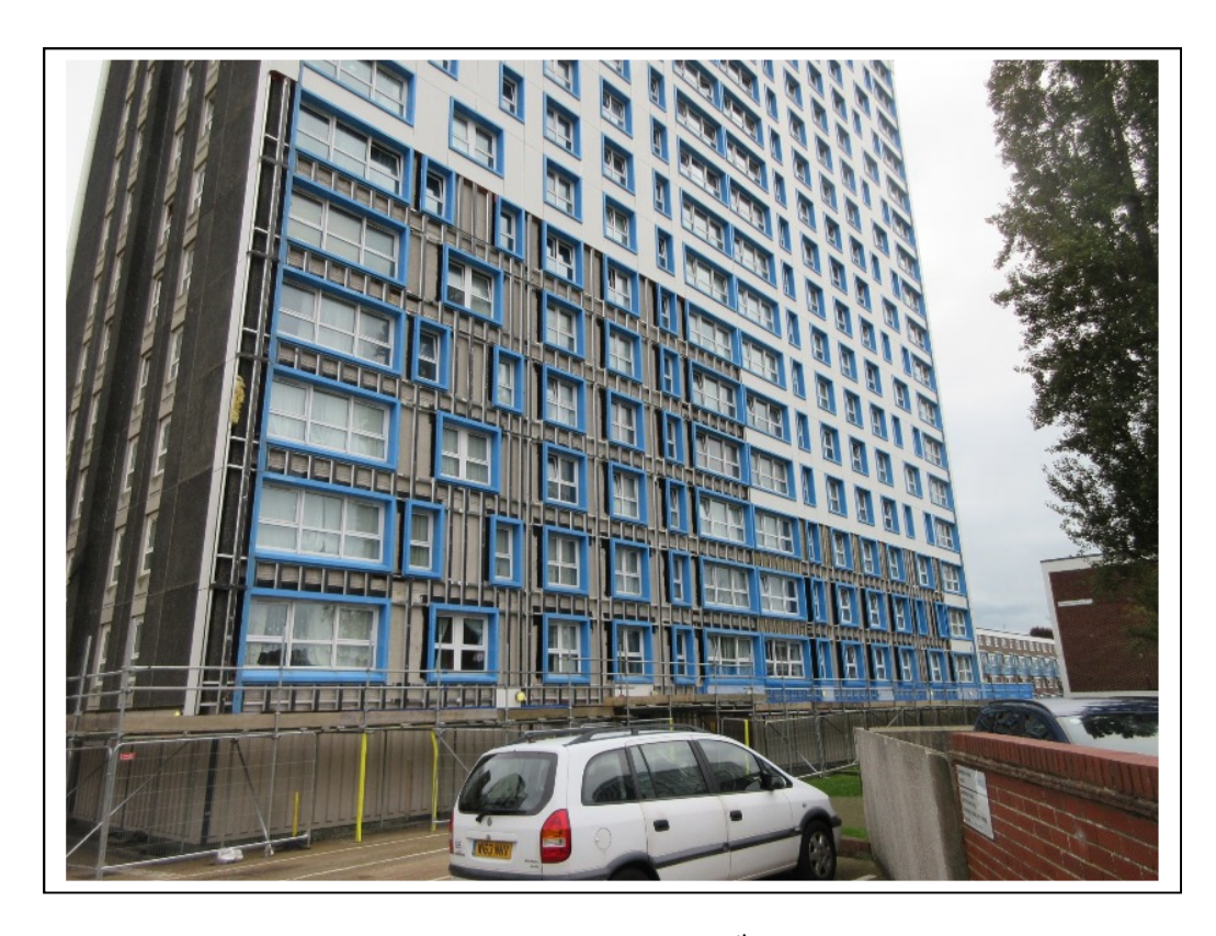
Figure 14 - West elevation, 50% of cladding removed to 7^{th} storey, remainder of cladding removed to 4^{th} storey