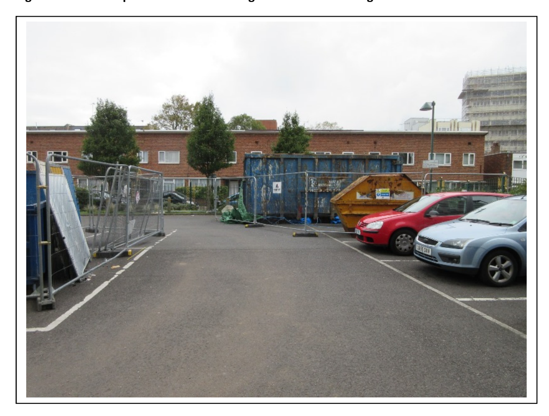
Figure 10 - Use of carpark to west of building for contractor storage