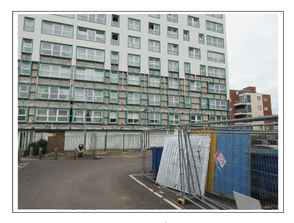
Figure 6 - West elevation, cladding removed to the \mathbf{4}^{\text{th}} storey