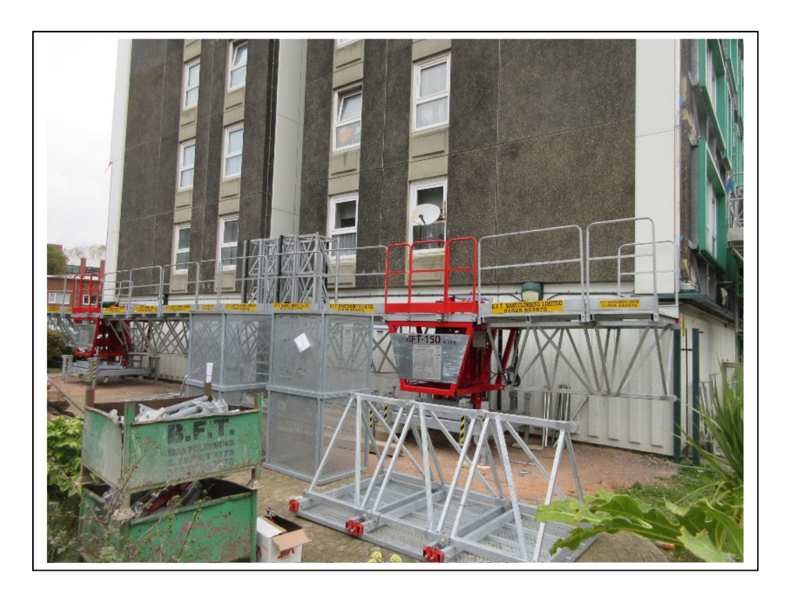
Figure 3 - Mast climber being installed to south elevation