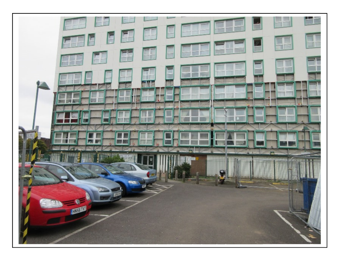
Figure 5 - West elevation, cladding removed to the \textbf{4}^{\text{th}} storey