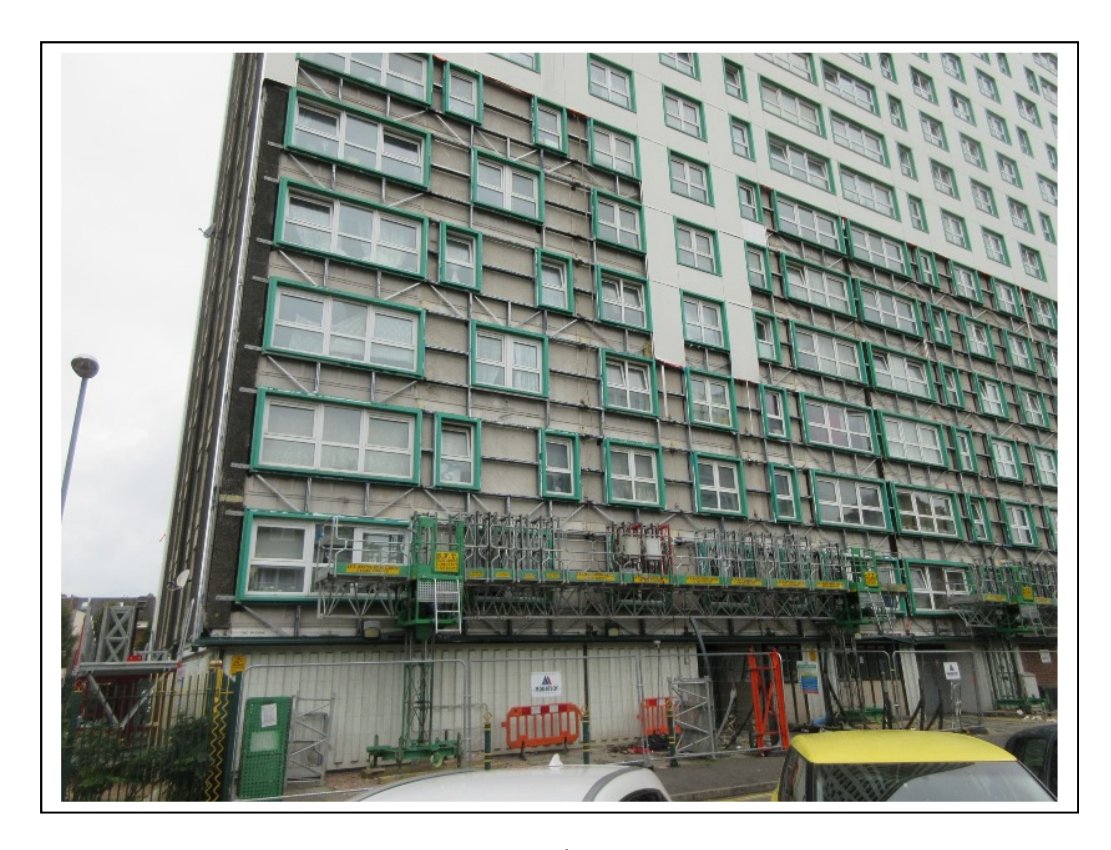
Figure 1 - East Elevation cladding removed to 6<sup>th</sup> floor, mast climber installed to 1<sup>st</sup> floor level