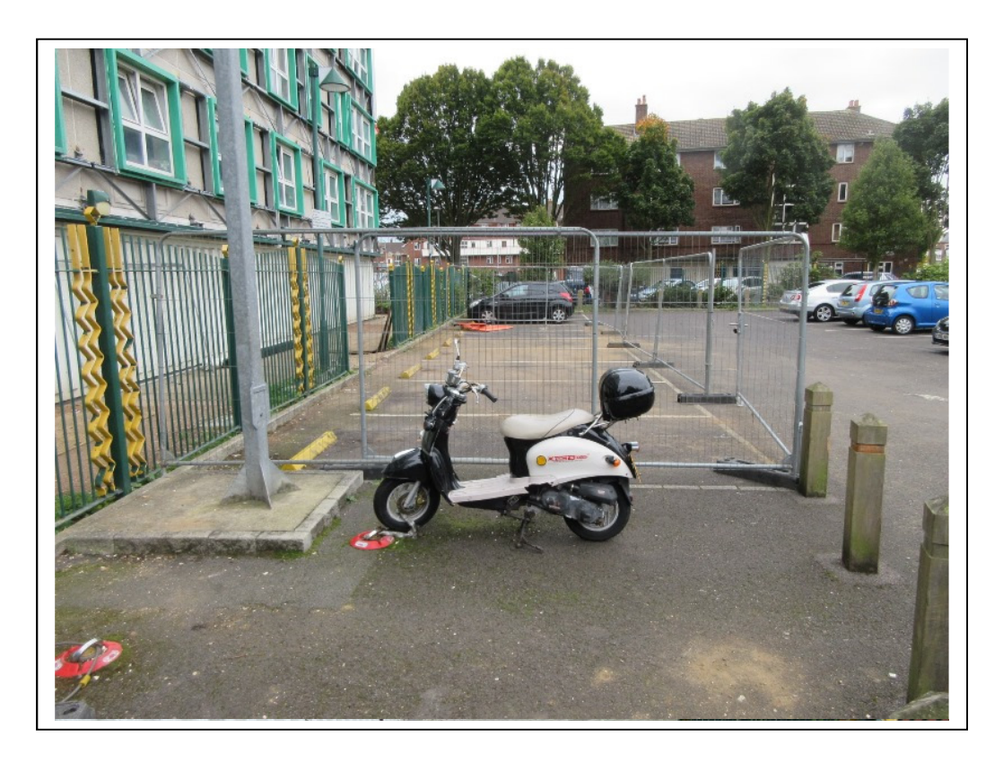
Figure 8 - Restricted car parking in car park to west of block