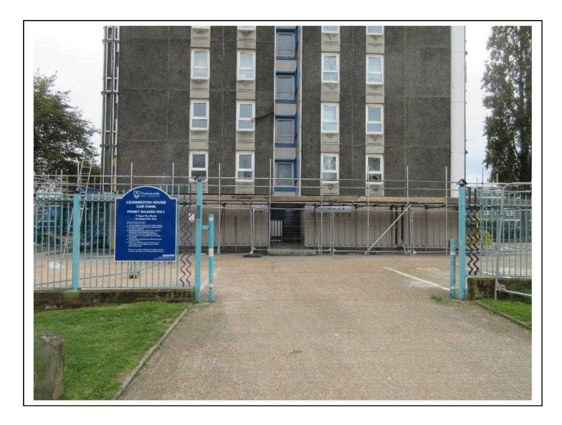
Figure 15- Scaffold fan install to north elevation