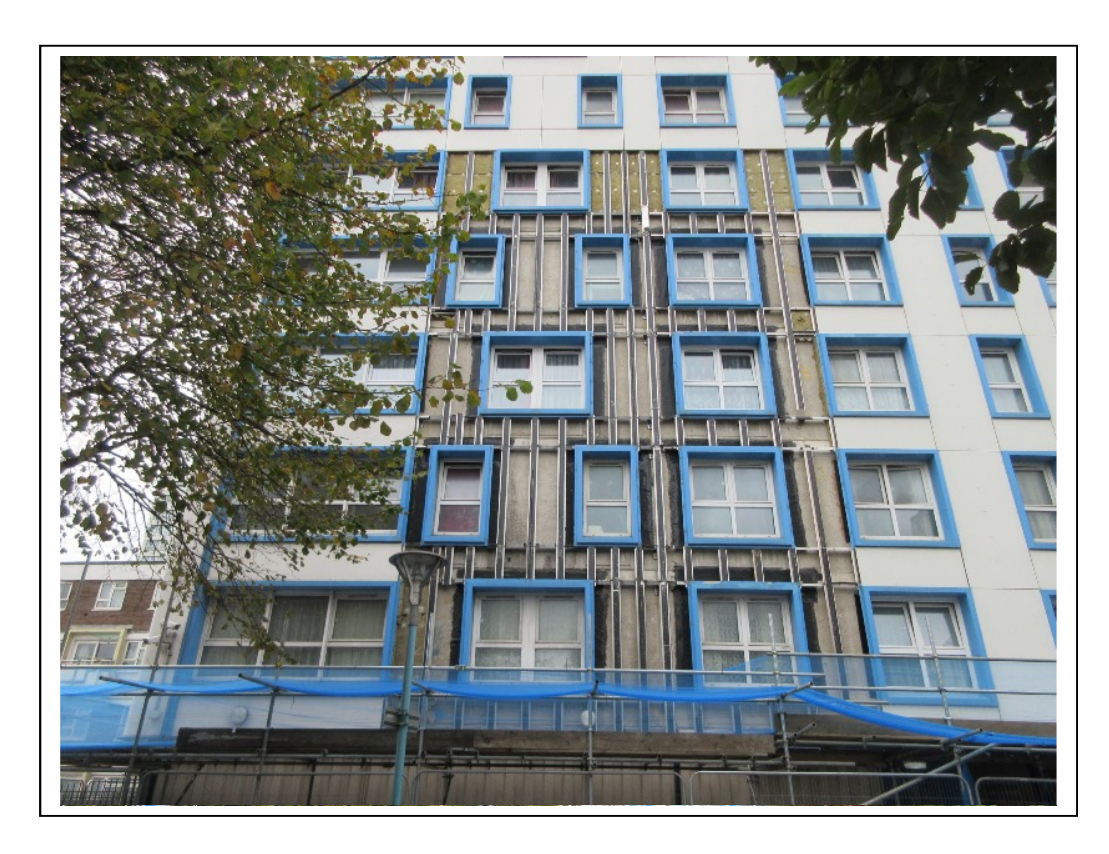
Figure 12 - East elevation, cladding partially removed to the 5<sup>th</sup> floor