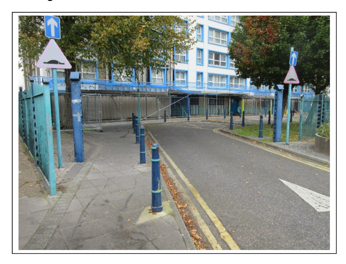
Figure 11 - Scaffold fan erected to main entrance, east elevation