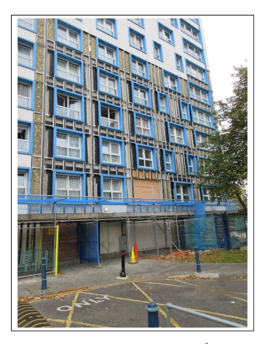
Figure 13 - East elevation cladding partially removed to 5<sup>th</sup> floor