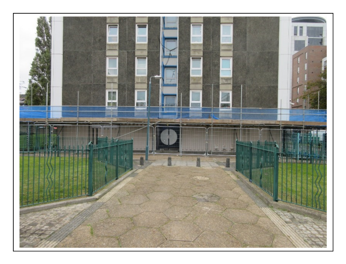
Figure 16 - Scaffold fan installed to south elevation