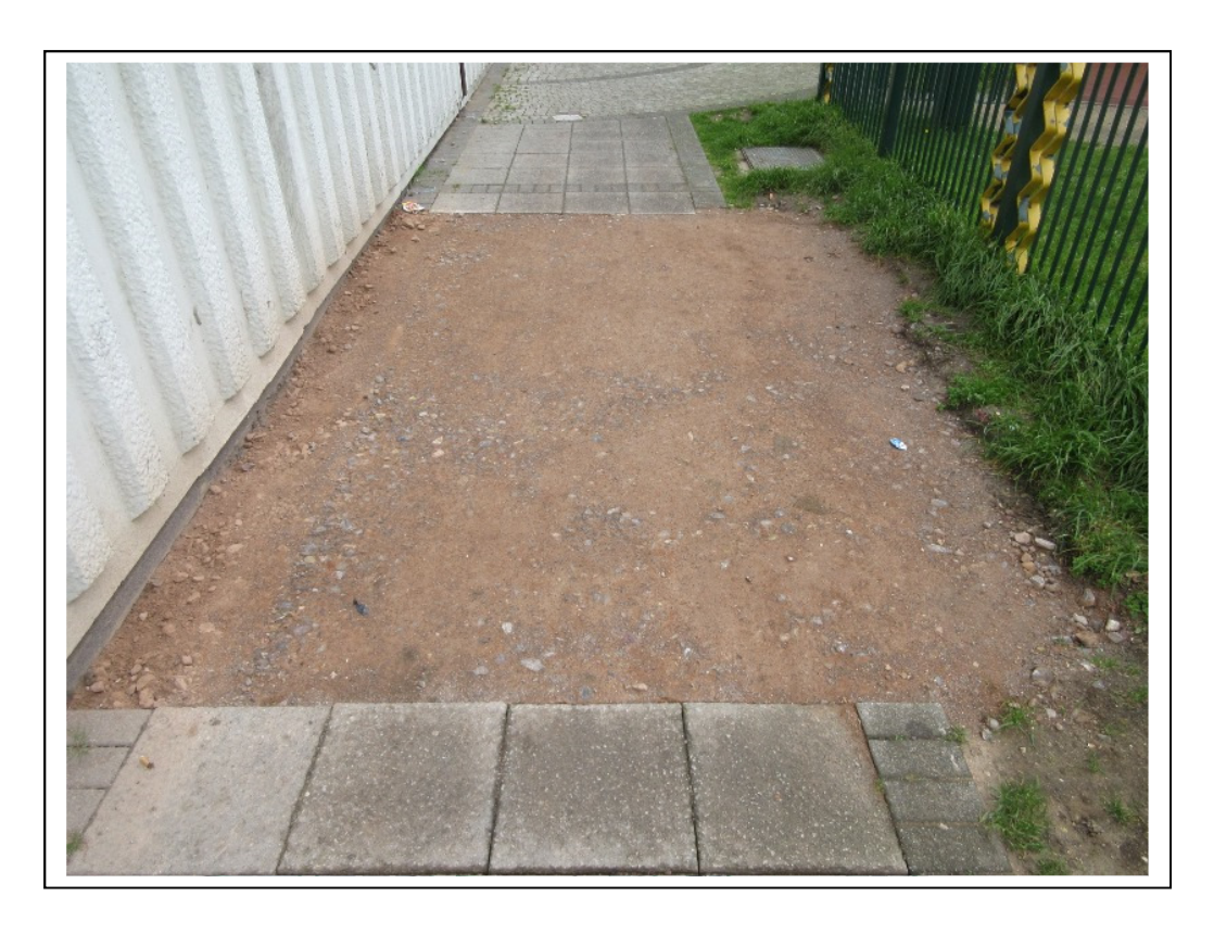
Figure 7- Example of a completed foundation to enable the mast climber installation