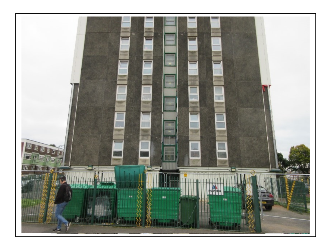
Figure 4 - North elevation